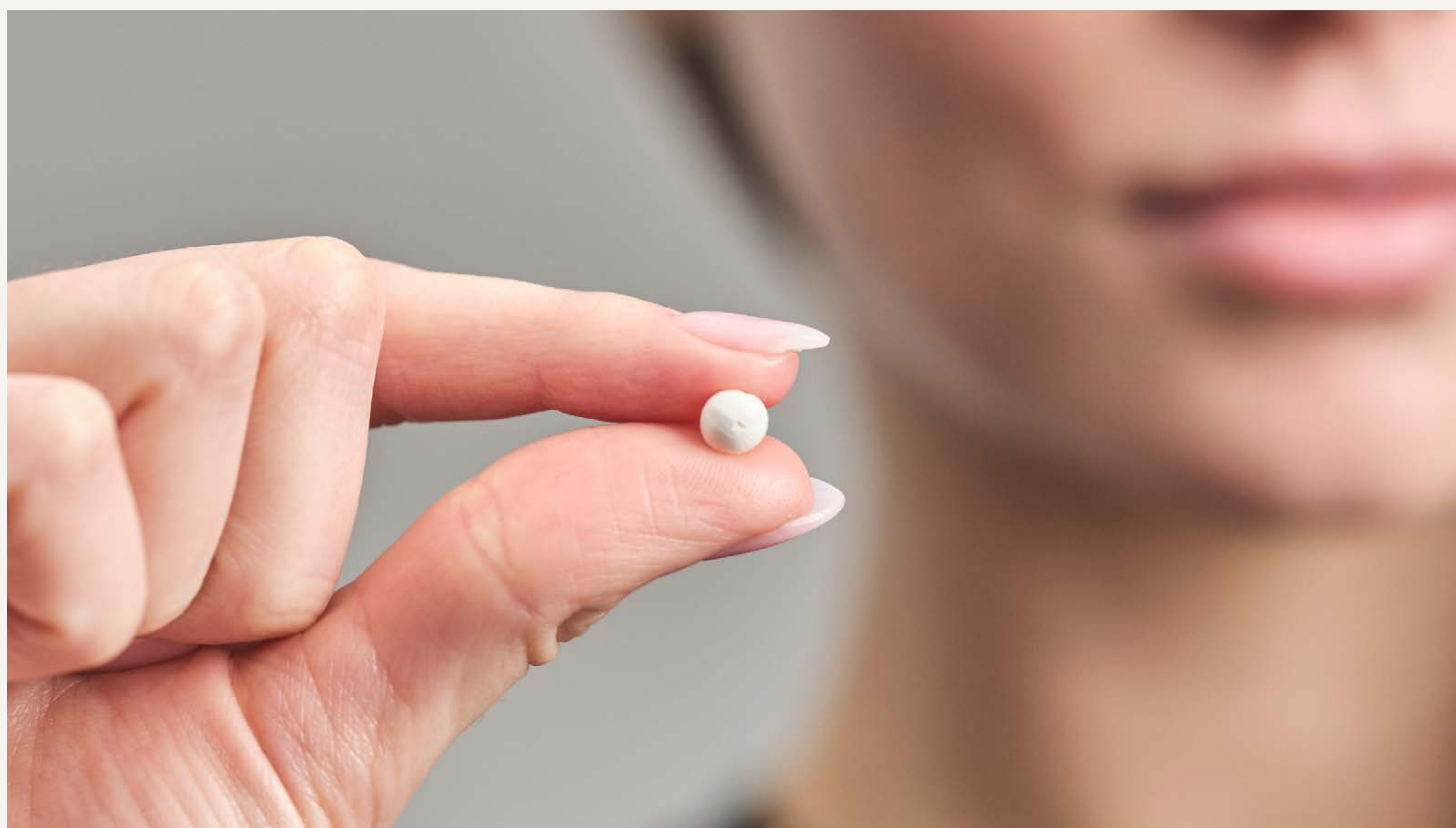
DRY PROTEOGLYCAN PELLETS PHOTOGRAPHED BY EVOLVED BY NATURE

Evolved By Nature has won the prestigious Rising Star Award at in-cosmetics Global 2025, the leading global event for the personal care industry. The award recognizes first-year exhibitors for their innovative products and ingredients, as well as their solution-driven approaches.